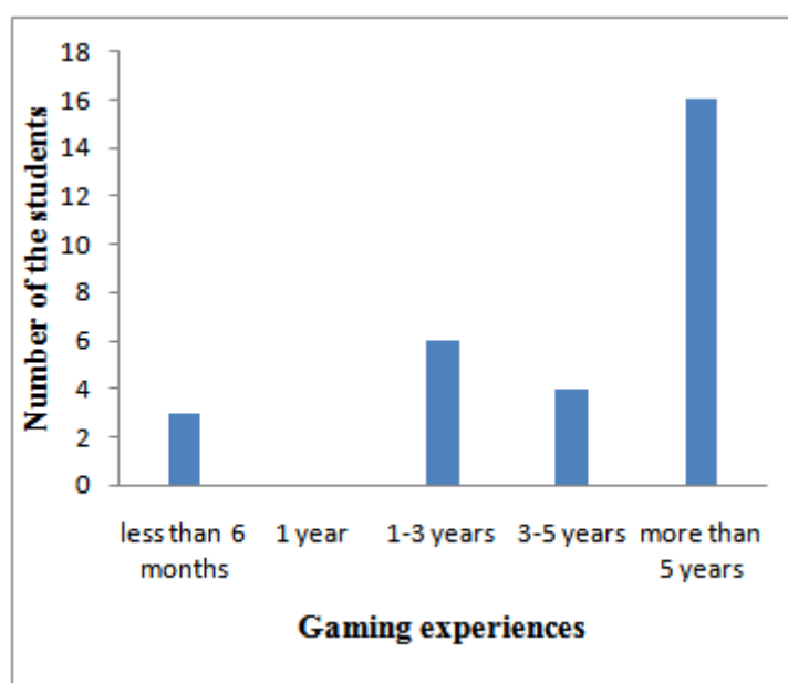
Fig. 1. Gaming experiences of participants